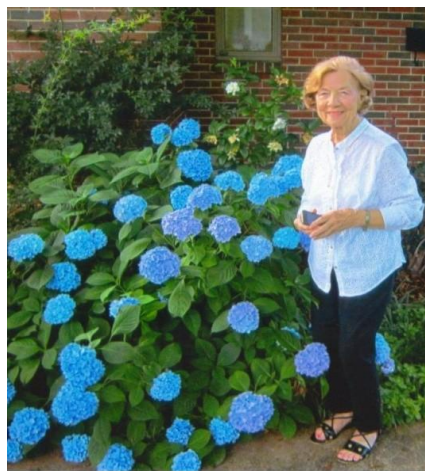
This summer I agreed with Fran Brandon’s “Niki Blue” hydrangea. It responded by displaying some really show-stopping color.